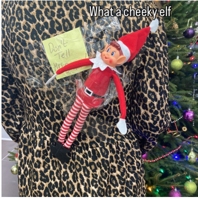
What a cheeky elf