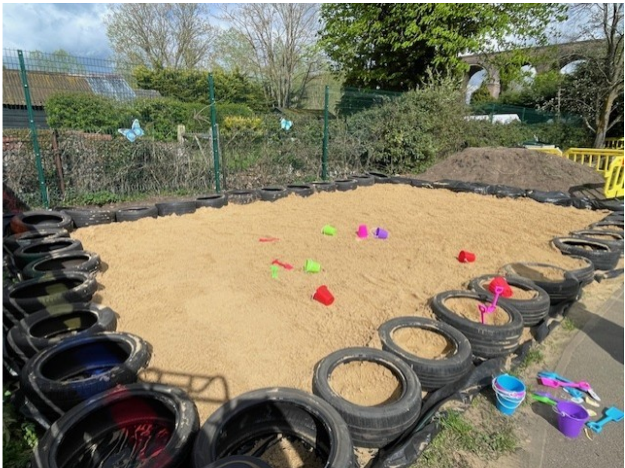
Soft washed sand suitable for Primary schools as per Opal guidance.